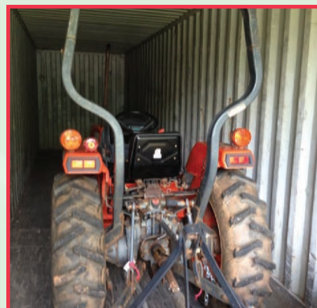
Two tractors of different sizes were donated, along with a "bushhog" which will clear land very quickly compared to manually clearing the land by hand.