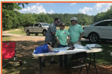
Groups of people bring donated items to fill the container, many giving extra funds to ship it to Liberia.