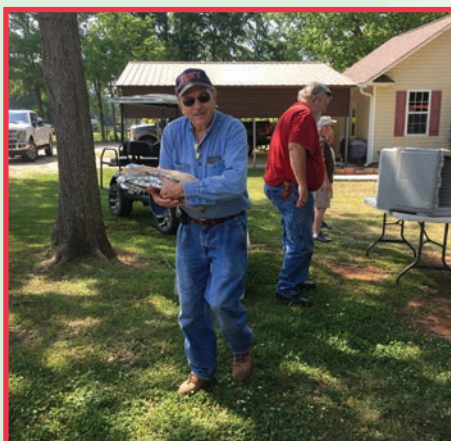
Members of the community buy donated ribs from Bubba's to help pay to ship the container from Georgia, USA to Liberia.