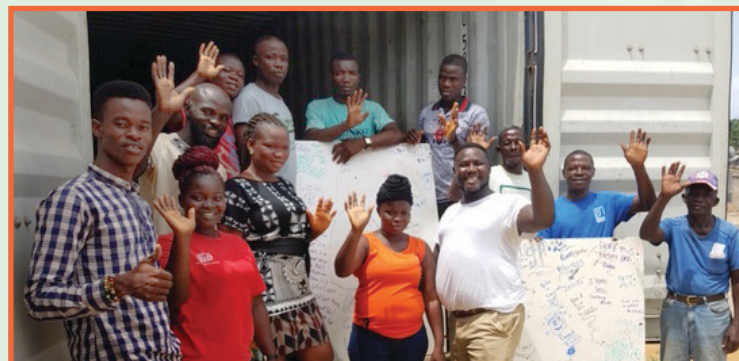
"Thank you for all of the goodies!"

"For as the soil makes the sprout come up and a garden causes seeds to grow, so the Sovereign LORD will make righteousness and praise spring up before all nations." Isaiah 61:11 (NIV)